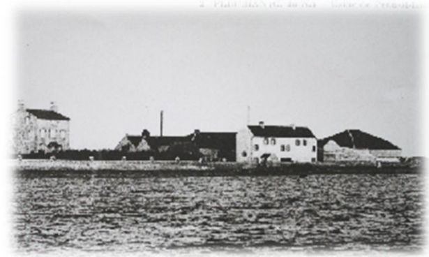
The Pleubian site second half of the 19th century

The harvesting season depends on the life cycle of each species of seaweed.